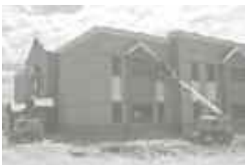
Workers put the finishing touches on Silver Crest Elementary in Herriman.

Silver Crest Elementary, located at 13000 S. 5500 West in Herriman, will open in August on a three-track schedule. The Kauri Sue Hamilton School, located at 2700 W. 13400 South in Riverton, will also open in August. The school will house students ages 5-22 who have severe multiple disabilities. A new high school in Herriman is currently under construction and will open in August 2010.