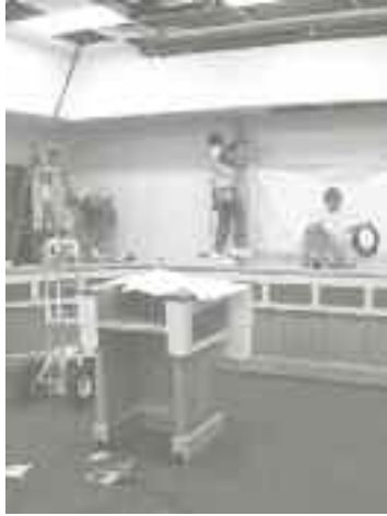
Contractors ready the Board Room for its first meeting on Aug. 11.

The Board of Education invites the public to open houses at its new District Offices on Tuesday, Aug. 4, from 2-4 p.m. The Administrative Office is located at 7387 S. Campus View Drive and houses school-related and employee-based services. The District Auxiliary Services Building is located at 7905 S. Redwood Road and will house support services. Board meetings and staff development classes will be held at the Auxiliary Services Building. High school student body officers will give tours of the new facilities and serve light refreshments throughout the afternoon.